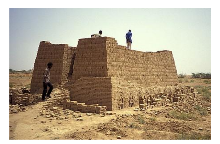
Figure 2: A brick clamp kiln is shown near Kassala.

A team of 15 labourers (three tables) was employed in the production of 118000 bricks at Kurmuta, west of Kassala town. 11 lorry loads (16393.50 kg) of fuelwood (miskit) from Kassala, 8 lorry loads of loose bagasse and 6000 blocks (7980 kg) from Halfa were provided for the production of bricks. Essential production tools, including Buller's bars for gauging firing temperature, were also acquired.