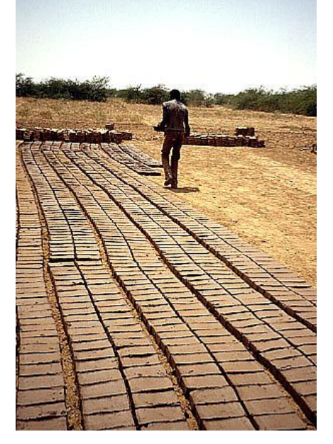
Figure 1: Moulded bricks pre-drying in the sun before being fired near Kassala.

Bagasse is a by-product of the sugar industry. It is the solid part of sugar cane that is rejected after extracting the molasses. Bagasse waste initially is whitish in colour but turns darker with time till it becomes very dark brown. Initially it is rough and coarse in texture but breaks up under ambient pressure and heat into very fine particles.